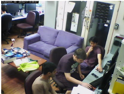
Figure 4.1: < https://webcam.ucc.asn.au >

We don't have cleaners, so we rely on our members to look after the clubroom. There is always a door member in the room if it's open. Of course, if you see something that needs doing such as cleaning up, feel free to do it!